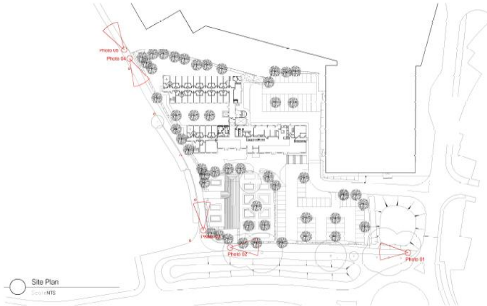
Site Plan Scale: NTS

Do not scale from this drawing. If in doubt, ask. This drawing is the property of ica and must not be copied, reproduced or disclosed without written permission. revisions: