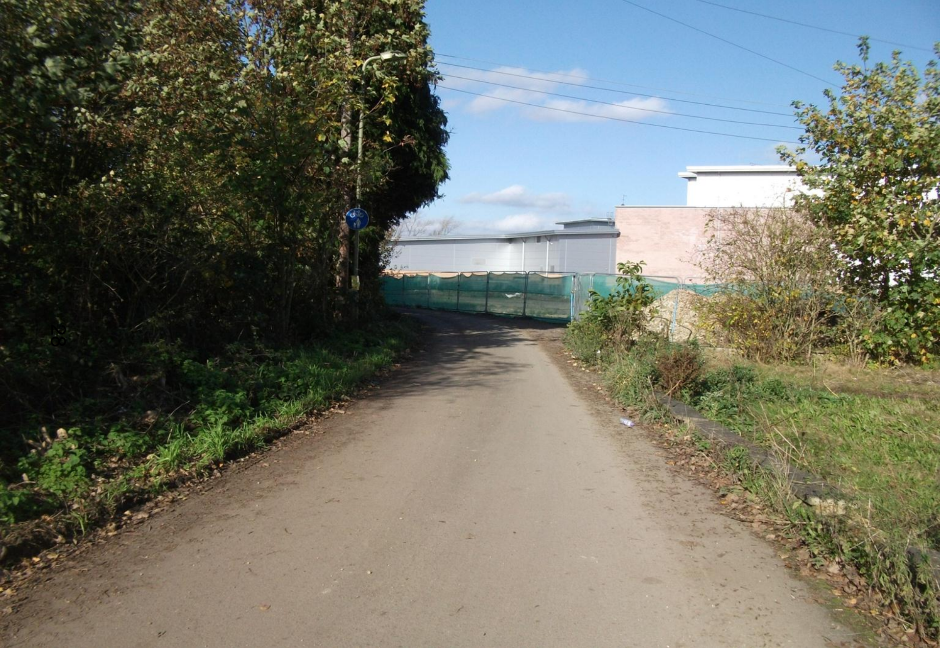
View of Minchery Farm Track