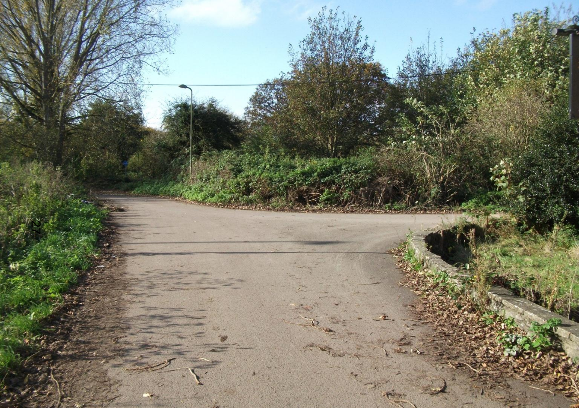
View of existing footpath leading towards Minchery Farm Track