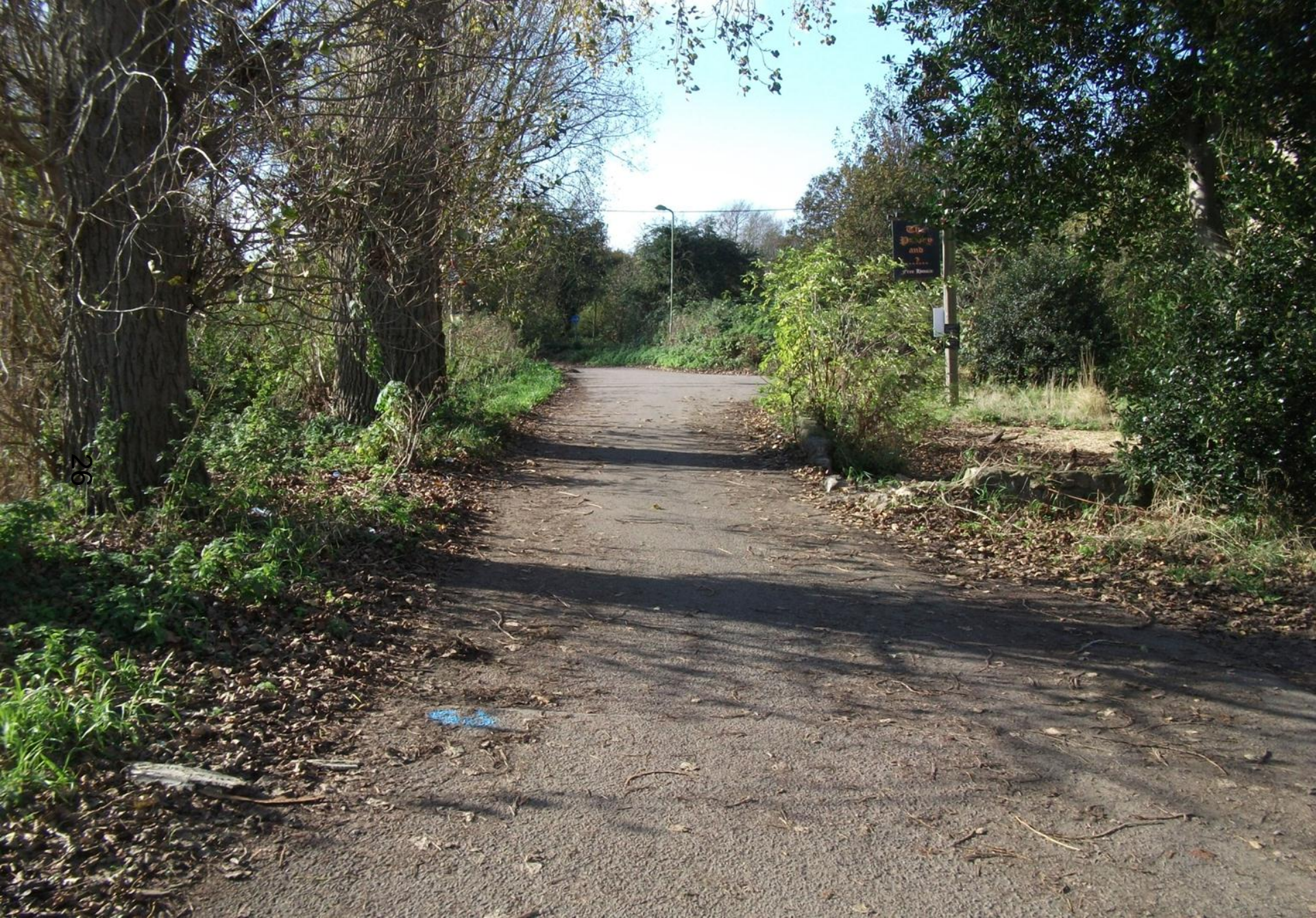
View of existing footpath leading towards Minchery Farm Track